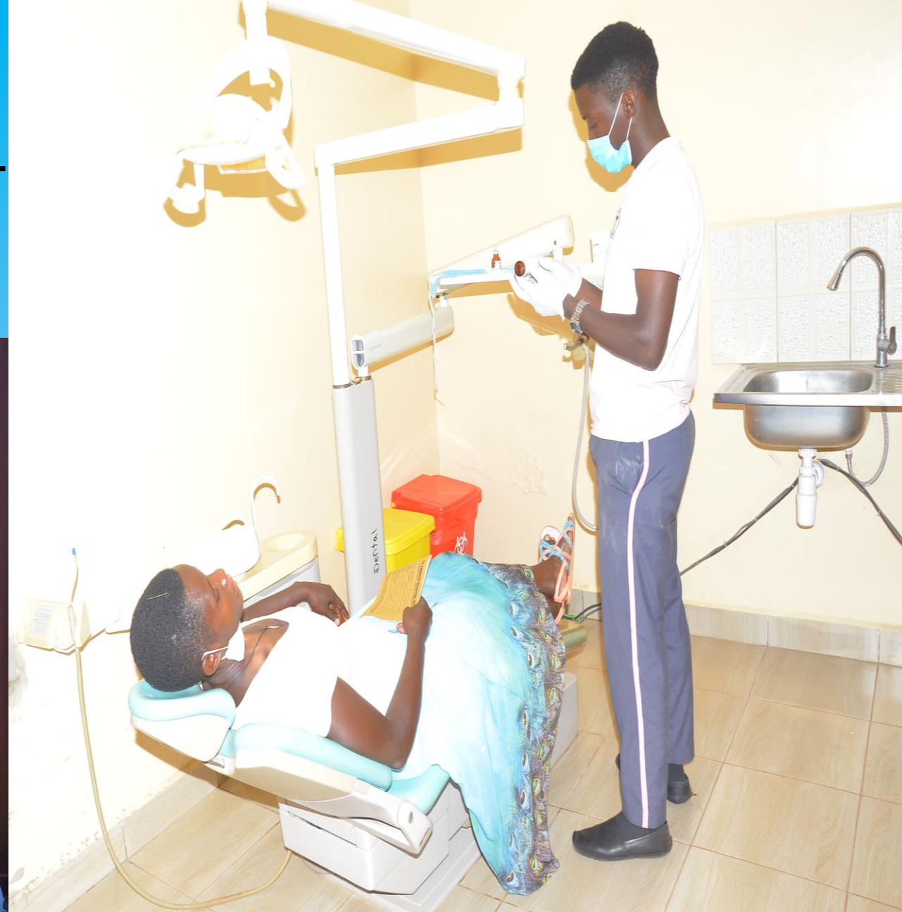
The Dentist taking care of the patient